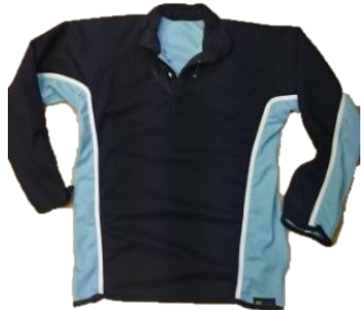
Navy blue reversible rugby shirt