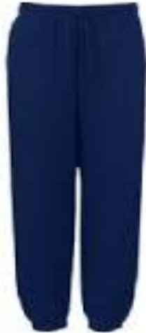
Navy blue tracksuit bottoms (optional)