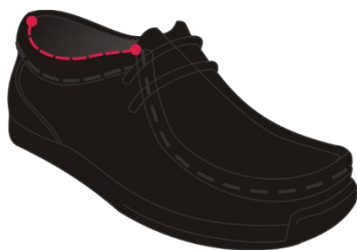
Black shoes (Boys)