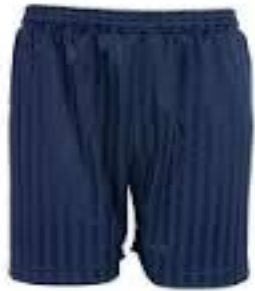
Plain navy blue shorts (no logos or stripes)