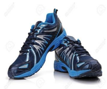
Non marking soled trainers (trainers do not need to be blue; pumps or plimsolls are not permitted)