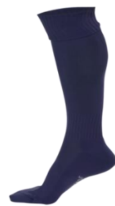
Navy blue football socks