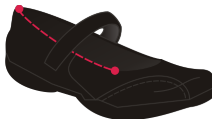
Black shoes (Girls)

(These images are only representative examples of appropriate school shoes)