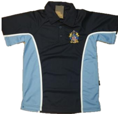
Navy blue crested polo shirt